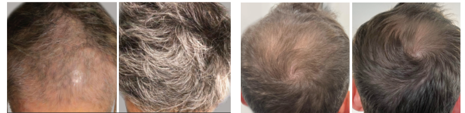
3 Treatments over 3 Months

AnteAGE MDX® Hair Exosomes are specifically targeted to upregulate WNT signaling while other active ingredients counteract the effects of DHT. Hair follicle genesis, function and phase transitioning is impossible without WNT signaling.