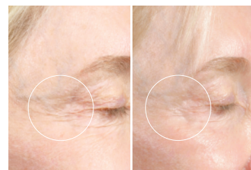
2 Weeks After One AnteAGE MDX® Microneedling Treatment