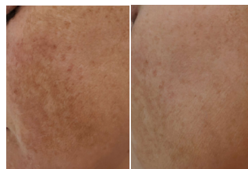
30 Days After One AnteAGE MD® Brightening Solution Microneedling Treatment