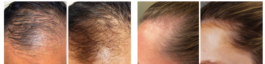
1 Treatment over 2 Weeks